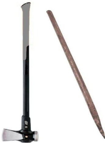
Metal Maul and Spike

So I think that is a pretty good description of Saint Michael the archangel, especially with the huge sword. I looked up Claymore swords and they were long. They looked like double-edged swords and that hilt that he's talking about was a kind of metal protection on the handle of the sword to protect the hands in combat. The next verse is number 15.