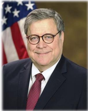
Attorney William Barr

whether he wins or loses. Is it possible that Donald Trump is going to pardon Joe Biden? What does he say? “There will be no viewing of the body today or ever again.”