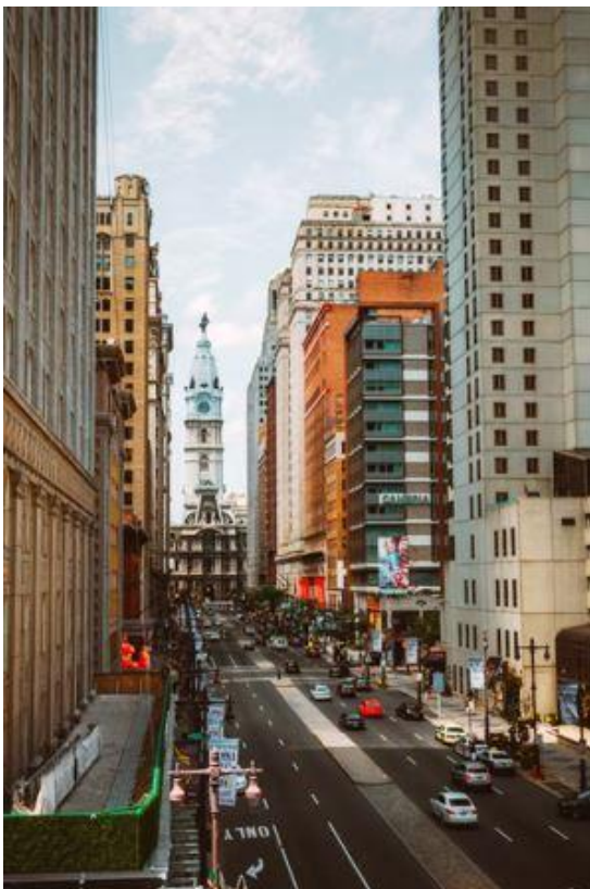
Philadelphia, USA, the home of the Liberty Bell

And I think you can get that picture, you get the image that the splitting of this Liberty Bell occurs where the crack had been.