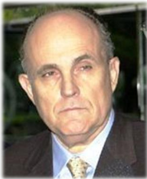
The Hon. Rudy Giuliani

“And the senator sat down and collected himself. Then he walked over to that pile of shoes and he dug through all these shoes until he found his pair. He put them on and he sat there for a minute, looked around, and you could tell he was getting angry and he rushed out of the room and he was running like a sprinter's pace to get out of there.”