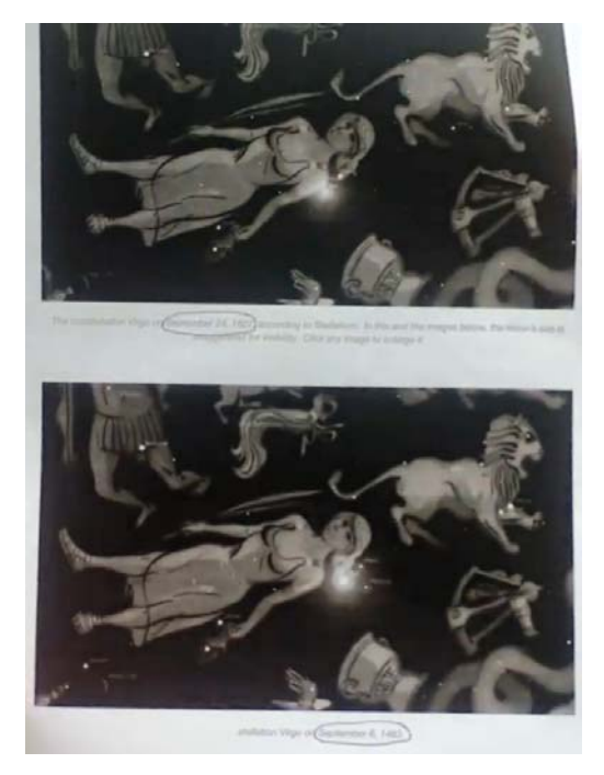
truly the Great Sign.