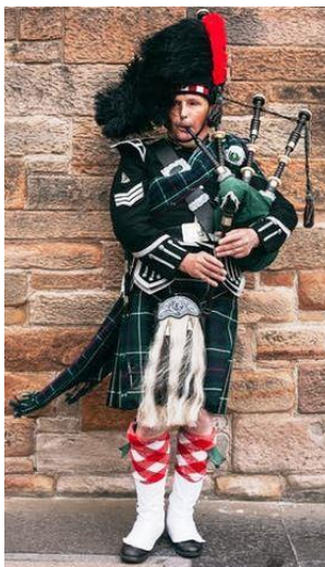
Donald Trump is of Scottish ancestry

And I thought he was Saint Michael the archangel, but as I say, I'm only